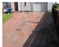
PATTERNED IMPRINTED CONCRETE